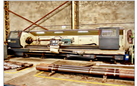
CNC Turning Centre