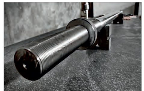
Injection Moulding - Tie Bar