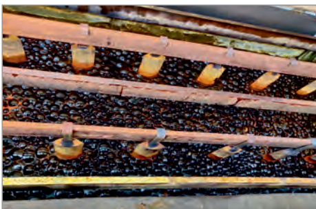
Hard Chrome Plating Tank