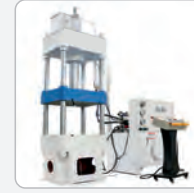
Hydraulic Lift & Press