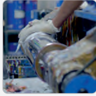
Printing & Rotogravure