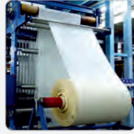
Converting & Packing